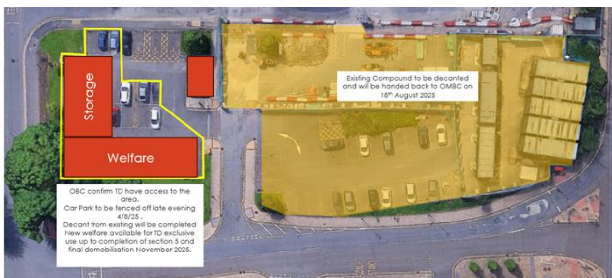
Background Papers under Section 100D of the Local Government Act 1972